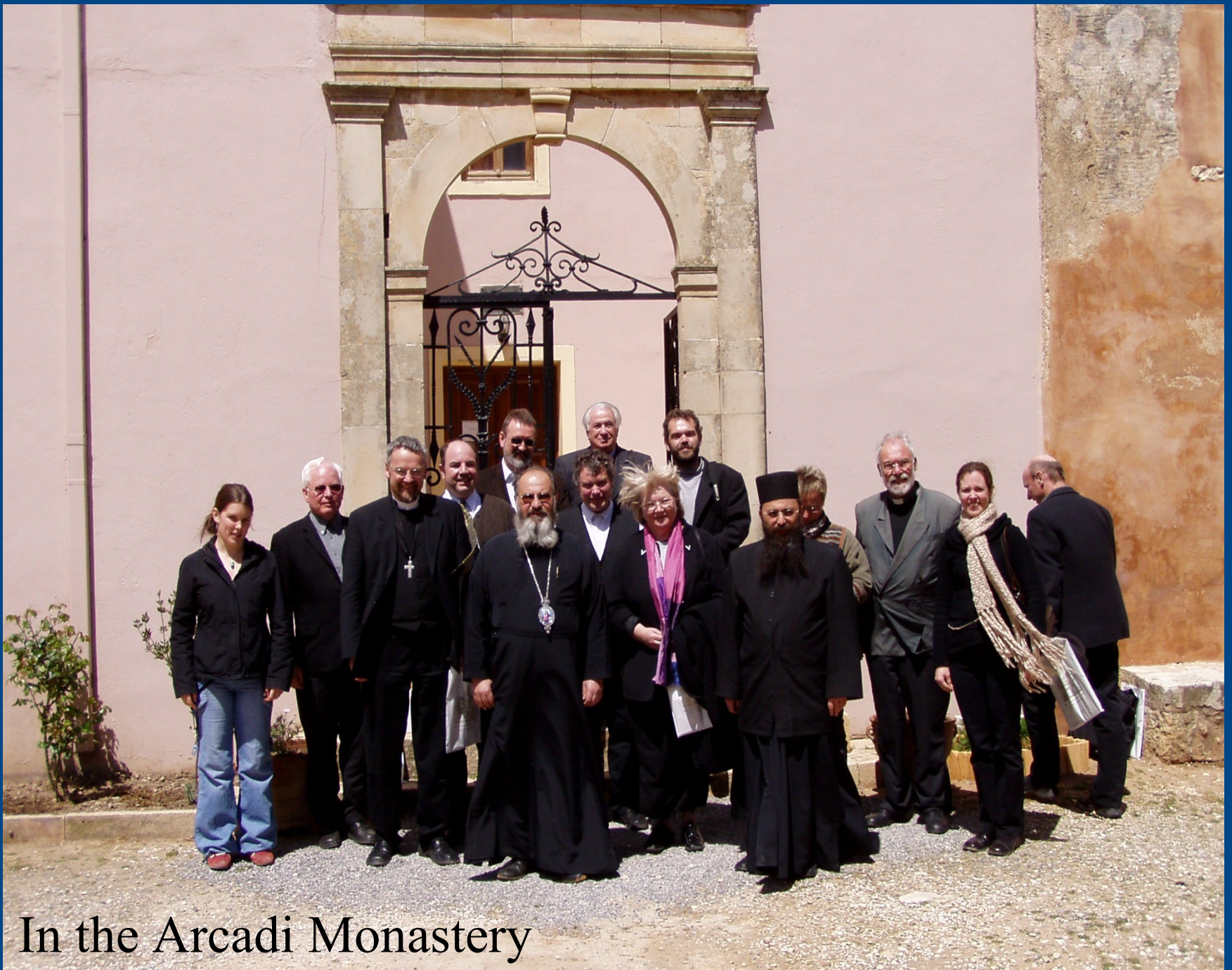
In the Arcadi Monastery