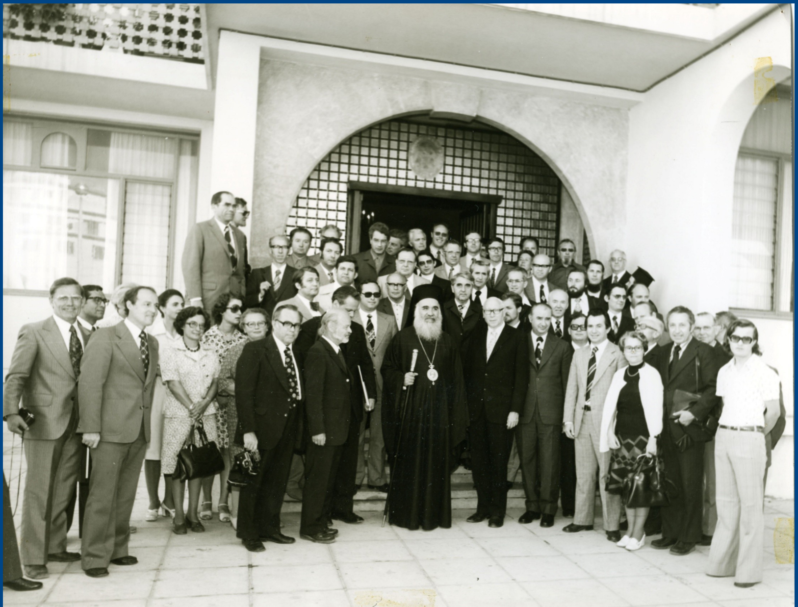
The archbishop of Crete Eugenios welcomes members of a seminar on Living Orthodoxy