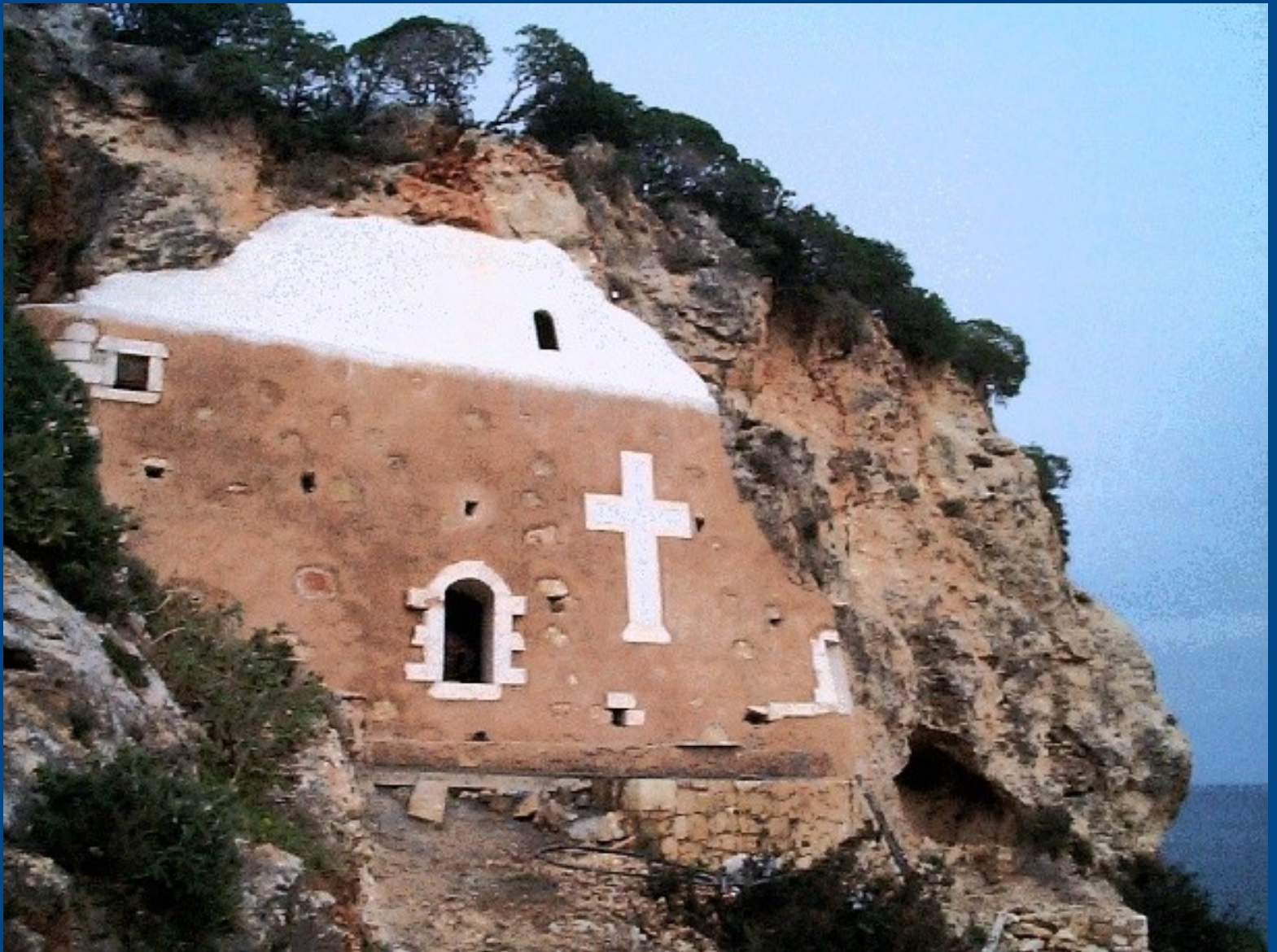
St. Makarios Chapel