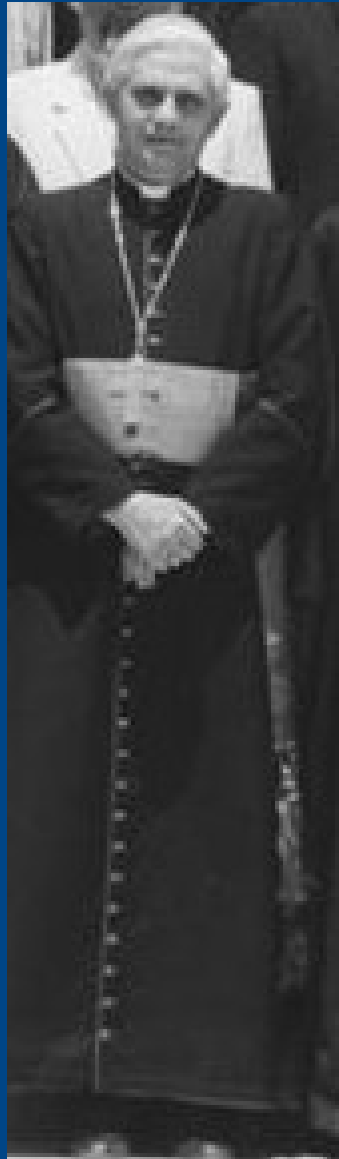
The new Pope Benedict XVI. (in the OAC 1984)